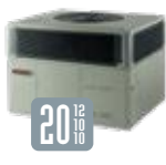
XL16c 4DCZ6 Up to 16.00 SEER