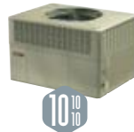
XR14c 4WCC4 14.00 SEER/8.00 HSPF