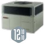
XL16c 4WCZ6 Up to 16.00 SEER/8.50