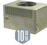
XR14c 4TCC4 14.00 SEER