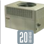
XR14c 4YCC4 14.00 SEER/81% AFUE