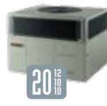
XL16c 4YCZ6 Up to 16.00 SEER/81% AFUE