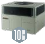
XL15c 4TCY5 15.00 SEER