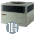
XL14c 4WCY4 14.25 SEER/8.00 HSPF