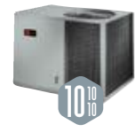
XR14h 4WHC4 OVER/UNDER 14.00 SEER/8.00 HSPF